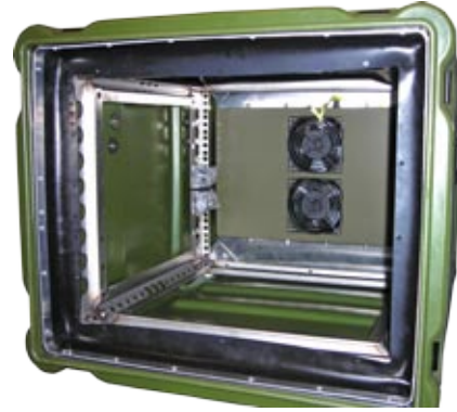
Images shows rotomoulded 8U Amazon racks fitted with a thermoelectric 1500BTU cooler and protective skirt.